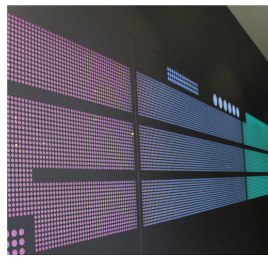
The Filaments SW8